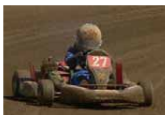
Kyle Angel - Midgets